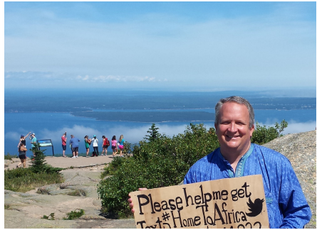
On Cadillac Mountain

In my teenage years, I believe the Author of our Faith (Hebrews 12:2) called me to serve Him overseas with my language skills. So I went to Faith School of Theology in Charleston, Maine (now Faith