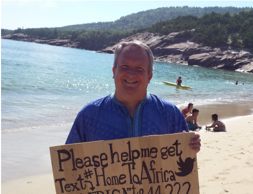
Sand Beach, Mount Desert Island

As for Desert Springs Ministries, we provide