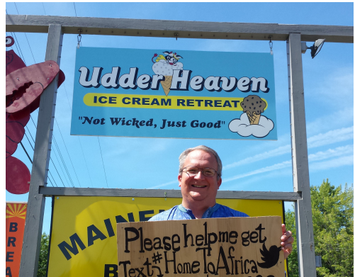
It's easy to get to "Udder Heaven"!

If it's somebody's birthday, your kids might like an ice cream cake in the shape of a lobster, or a homemade ice cream making party! If this is something you may be interested in, be sure to call ahead.